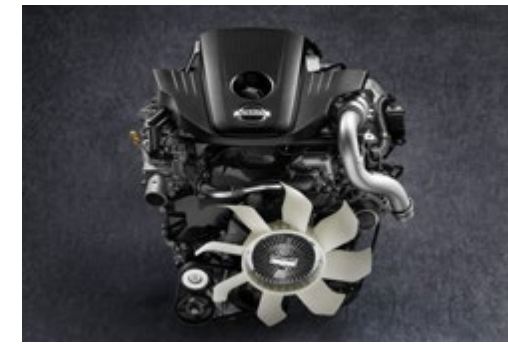
2.5 DDTI INTERCOOLED TURBO DIESEL ENGINE

Whether it's rush hour traffic or pouring rain, count on the muscle, efficiency and safety you need to get you through it comfortably.