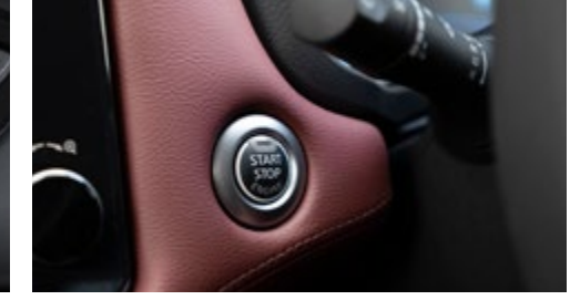
PUSH STOP START

Lock and unlock the doors and trunk by simply pressing the Request Switch on the door handle when you have your TERRA Intelligent Key on you. Then start or stop the car with a touch of a button for a seamless, keyless experience.