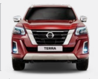
1 870 mm