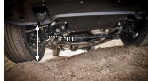
ELECTRONIC LOCKING REAR DIFFERENTIAL

Going off-road? You'll need more grip. The TERRA's On The Fly 4X4 system allows you to instantly switch between efficient 2WD and the powerful 4Hl. Navigate obstacles, deep sand, snow, mud, or you daily roads with ease.